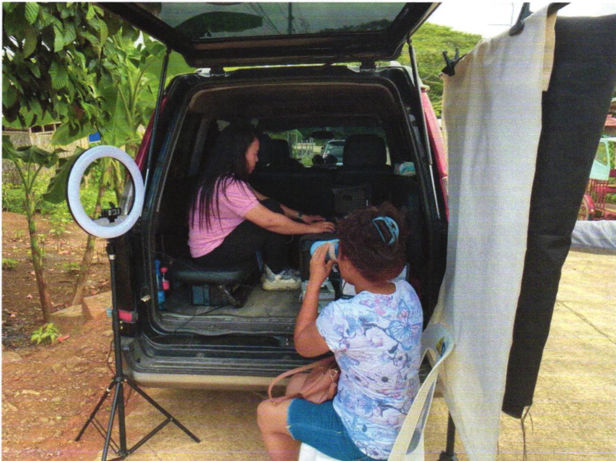
A resident of Supe Village in Puerto Princesa, Palawan registers to PhilSys through the mobile registration initiative, PhilSys on Wheels.

In any of these registration efforts, Filipinos can present their supporting documents for validation of demographic information and collection of biometric information such as fingerprints and iris scanning. Their front-facing photograph will also be captured following the International Civil Aviation Organization (ICAO) standards for photos, which is the international standard for the issuance of national IDs.