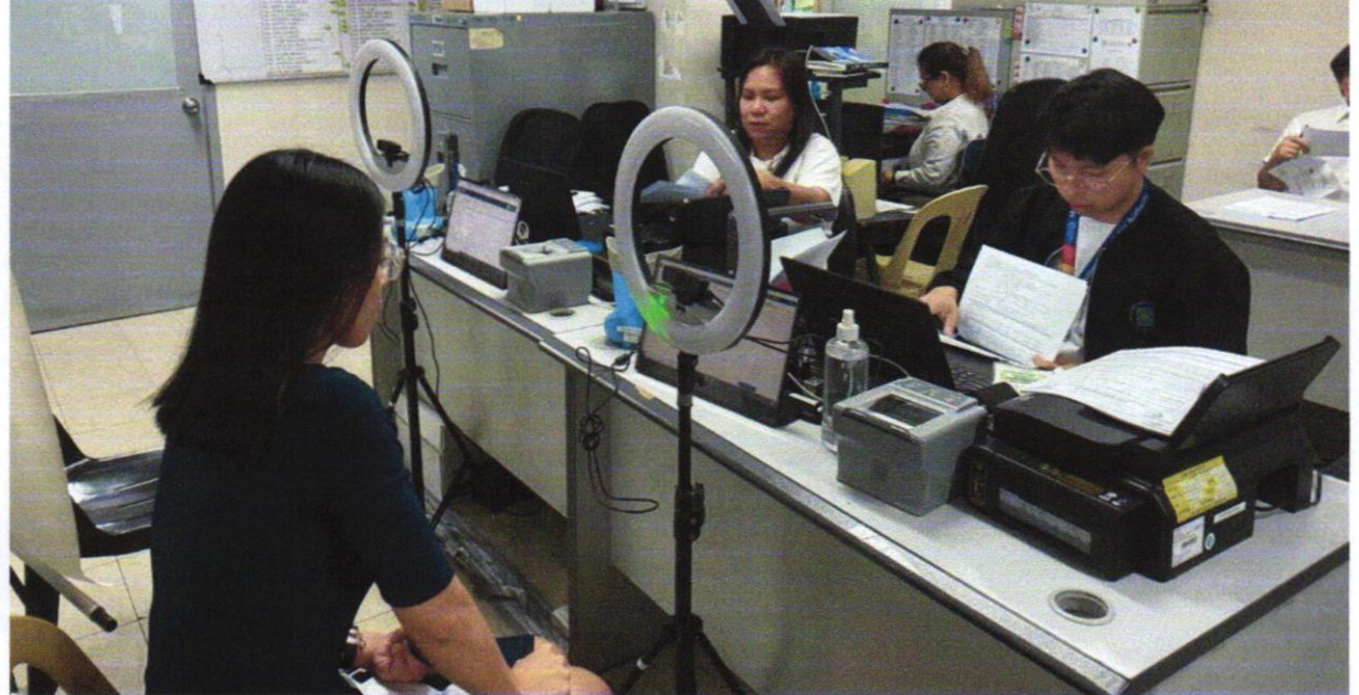
PSO - NCR II offers PhilSys registration and ePhilID issuance to employees and clients of the PAO District Office at the Quezon City Hall through its one-day institutional registration activity.

Through the registration activity, a total of 48 individuals were able to register to PhilSys and 44 were able to claim their ePhilIDs.