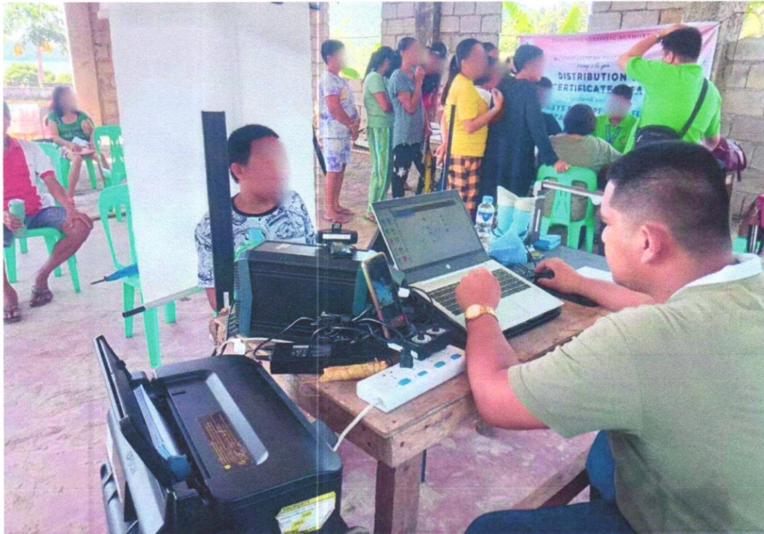
A resident from the far-flung coastal town of Castilla in Sorsogon registers to PhilSys.

Institutional registration activities are also being conducted in public and private institutions. Bringing registration services in schools has allowed students and school personnel to register to PhilSys conveniently. The same service, along with ePhilID issuance and authentication for identity verification, is now available for Pantawid Familyang Pilipino Program (4Ps) beneficiaries and their children via Family Development Sessions (FDS) under the Department of Social Welfare and Development (DSWD).