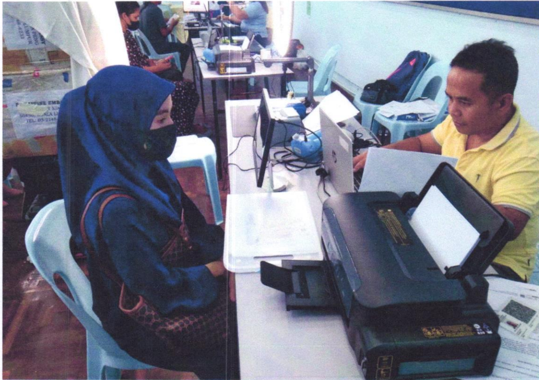
A Filipino residing in Malaysia registers to PhilSys.

In partnership with the Philippine Embassy in Malaysia and Migrant Workers Office (MWO), the PSA has also begun registering overseas Filipinos. PhilSys registration was offered to our kababayans at the Philippine Foreign Service Post in Kuala Lumpur. Registration services were also offered to Filipinos in Sandakan, Sabah.